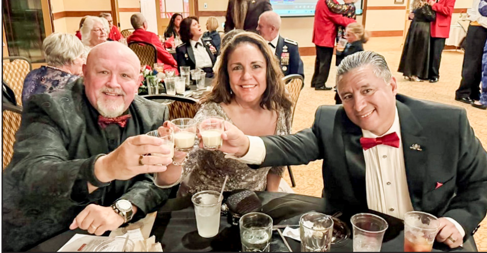
The Marine Corps Ball is always a fun occasion to honor those who served as well as the birthday of the U.S. Marine Corps itself.