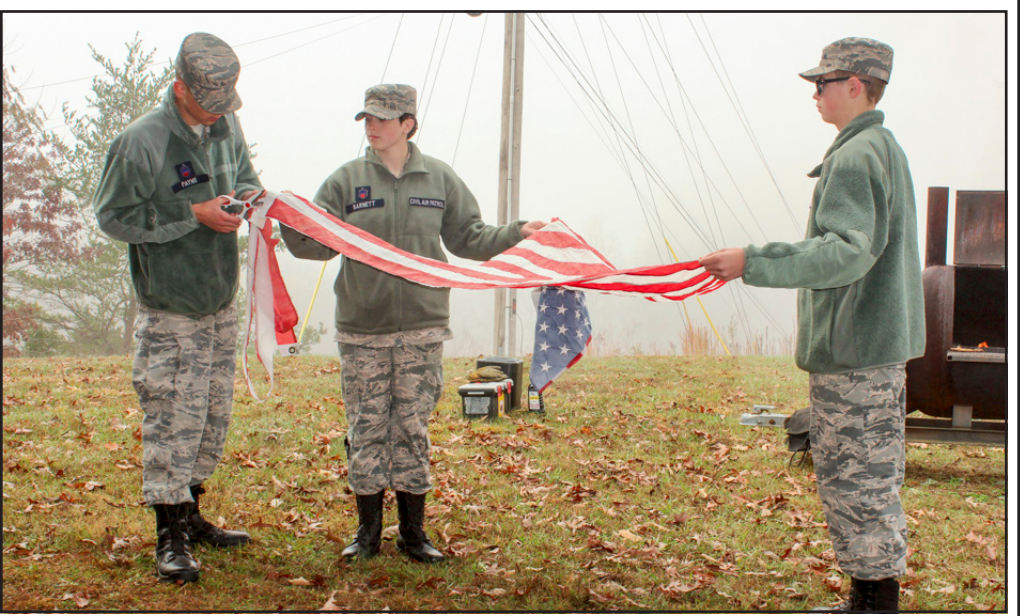
Local Civil Air Patrol cadets of the North Georgia Composite Squadron demonstrated proper flag retirement etiquette in Saturday's program by the American Legion.

Auxiliary, Sons of the American Legion and American Legion Riders, the event also involved organizations like Sons of the American Revolution, 152nd Civil Air Patrol and local Scout chapters.